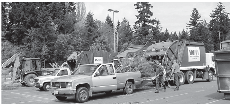
Shoreline's spring Clean Sweep Recycling Event helped residents dispose of tons of garbage and recyclables.