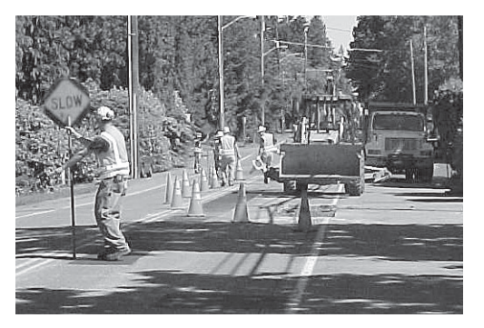
City Road crews prepare the roadway for the annual overlay of new asphalt this summer. Cracked road surfaces are removed with a backhoe and replaced with new asphalt.

Residents in the affected neighborhoods have been notified and will continue to receive updates from the City as the work progresses. For more information,