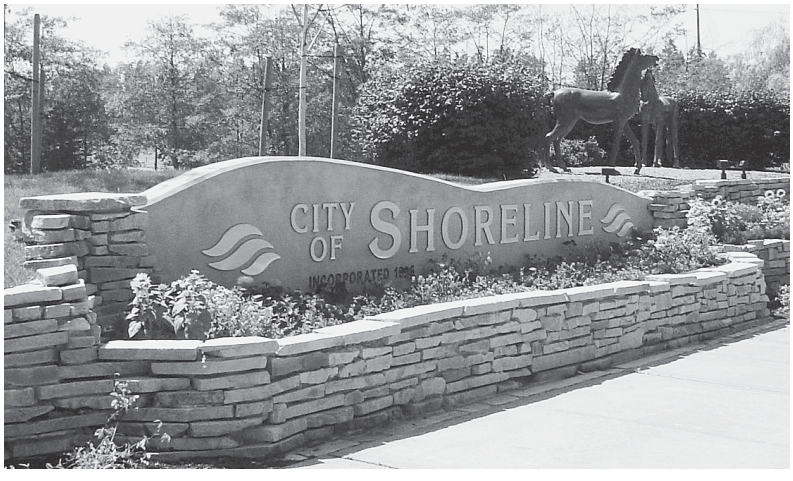
The first gateway the City completed was "The Ponies" Gateway at Ronald Bog Park on 175th.

The City's third gateway, at the Westminster-Dayton Triangle (at the intersection of Westminster, Dayton and N. 150<sup>th</sup> St.), will be