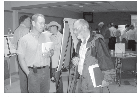
Shoreline residents turned out for the May 13 Comp Plan Update and Master Plans open house at Shoreline Conference Center.

• Westside Neighborhood Police Center, 624 Richmond