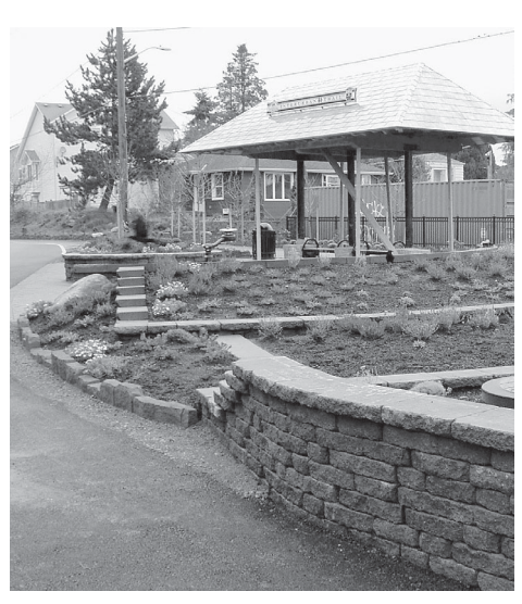
The Interurban trailhead at N. 145th St. features a kiosk, benches, landscaping and a drinking fountain with a dog bowl at the base.

According to Overleese, the goal is to build the first phase of the Aurora Corridor Project and