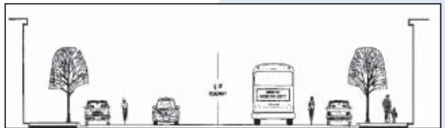
A typical cross-section of 15th Ave. NE in the North City Business District