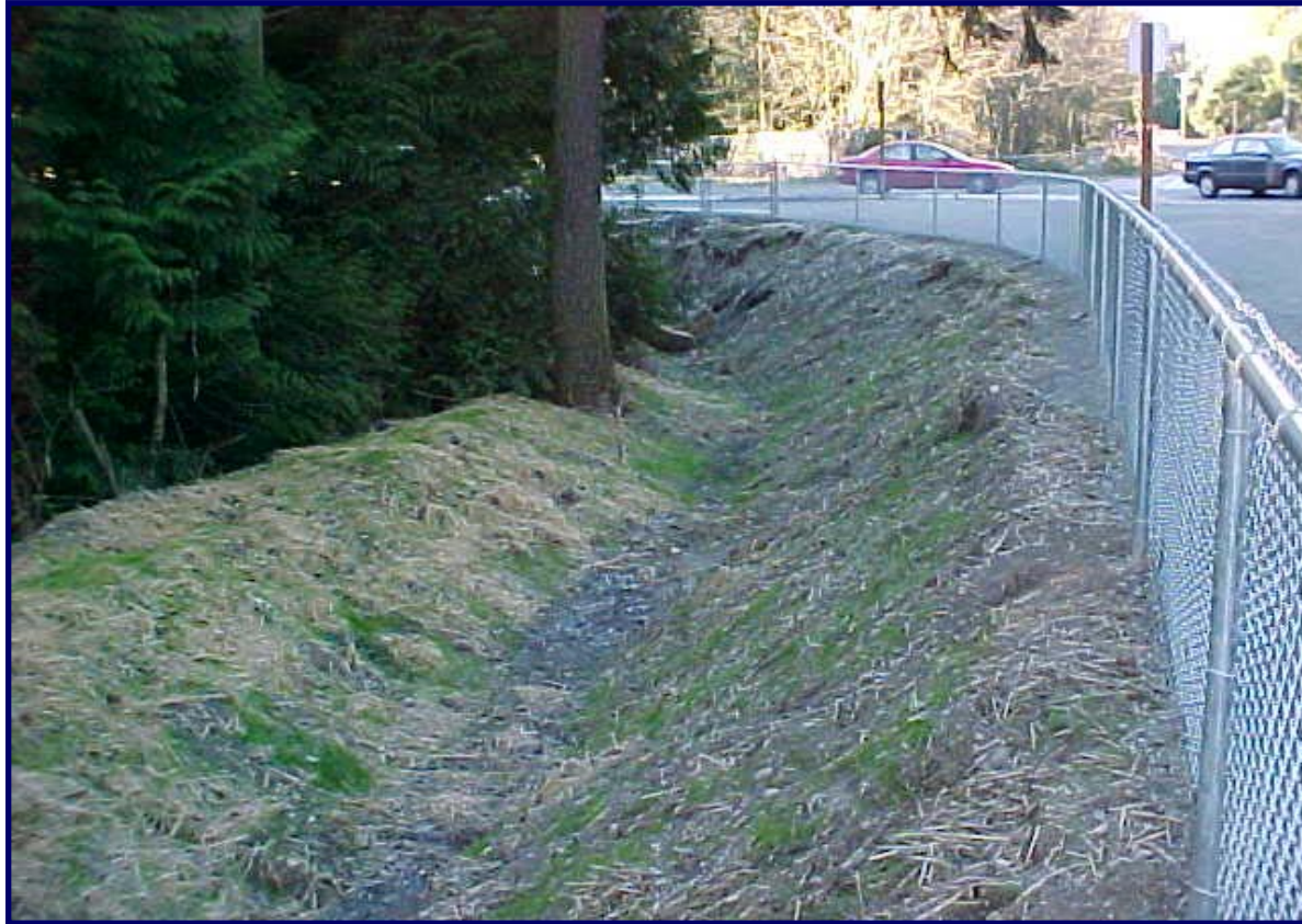
Drainage work on Carlyle Hall Road