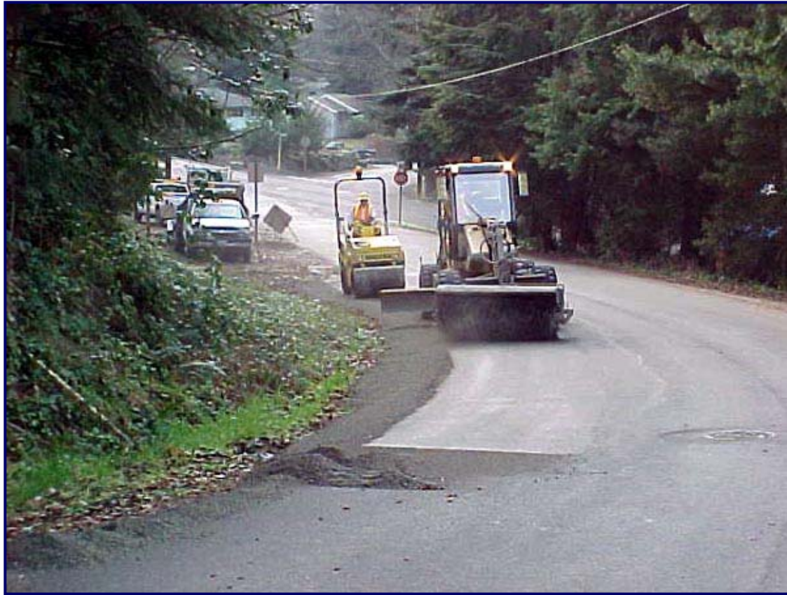
Road shoulder grading on Serpentine between 5 th and 8 th Avenues