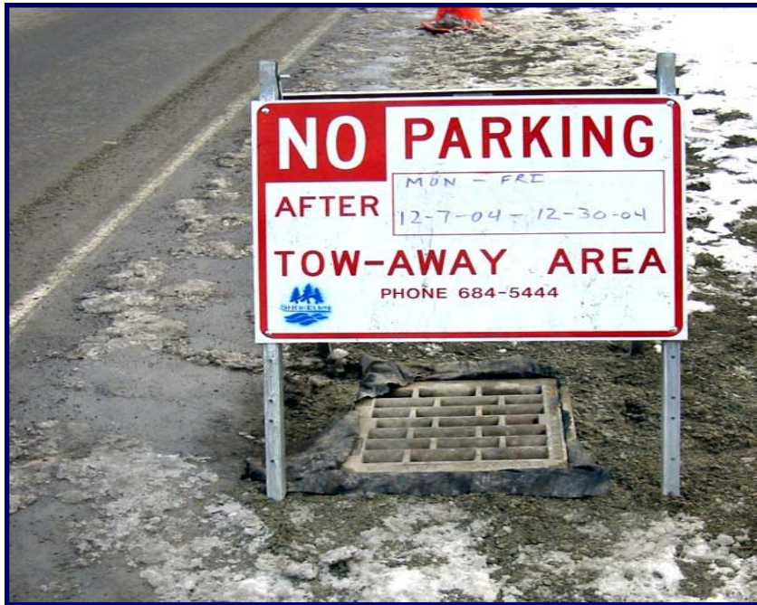
New catch basin on Carlyle Hall Road and Dayton Avenue N