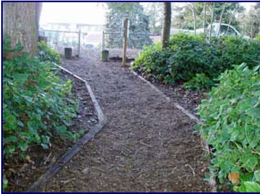
Northcrest Park west entrance