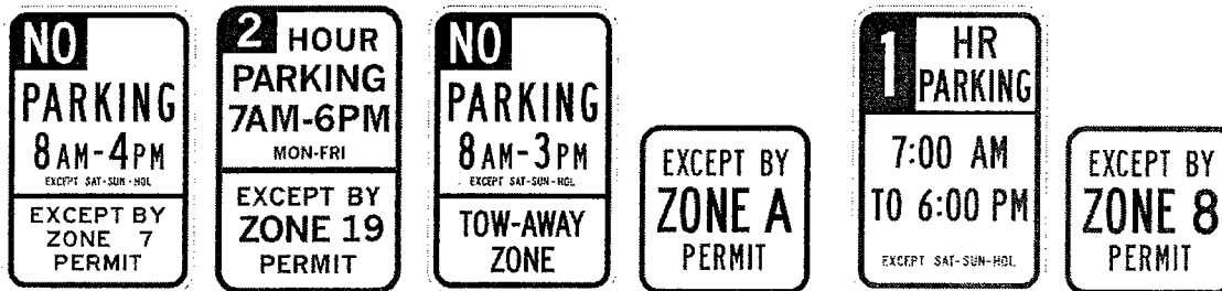
Figure 1 – Samples of RPZ signing

An RPZ involves the posting of parking time limits or parking prohibitions from which local residents are exempt if a valid permit is displayed in their vehicle. The following figures illustrate typical RPZ signing although the actual parking restriction may vary depending on the local conditions: