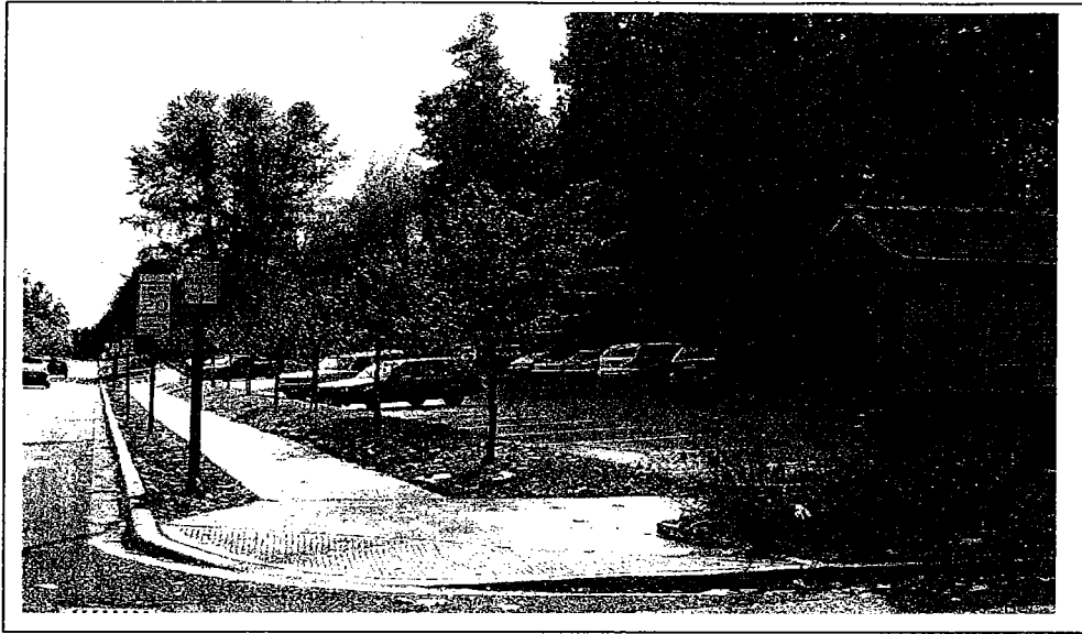
BRIARCREST IMPROVEMENTS SITE 25th Ave NE, looking south, at Hamlin Park Lot, NE 160th Planting strip on the left, kiosk on the right Mini-Grant: plant for two blocks in planting strip