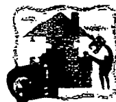
Honestly, you CAN work it out together

MEDIATORS are adults and kids who care about people and who have completed a special training of more than 40 hours. Using highly trained volunteers keeps the cost of your services low. All mediations are supervised by a professional mediator to ensure quality.