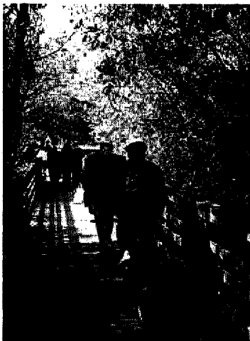
Twin Ponds Park

This program gives communities the opportunity to enjoy parks maintained without the use of pesticides and helps the City better understand how to care for its lands with less reliance on pesticides over the long term.