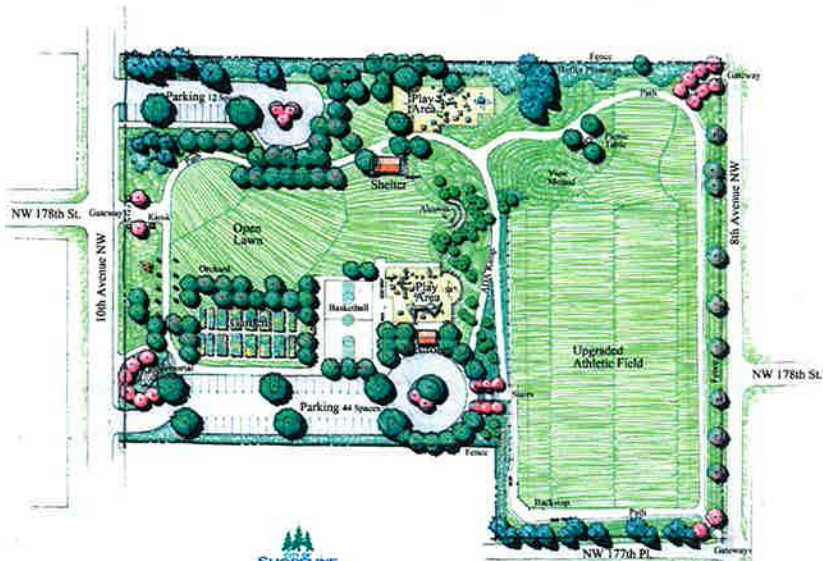
Sunset School Park Parks, Recreation & Cultural Services Department