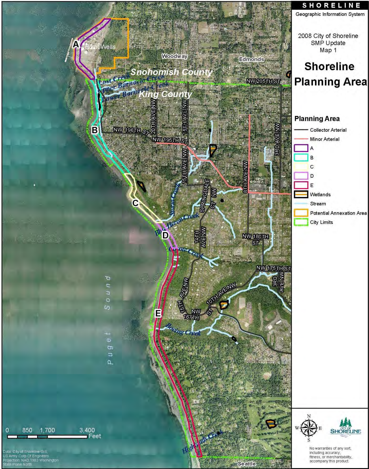
Map 1. Shoreline Planning Area