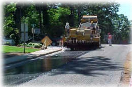
A fog seal is applied after the BST has cured