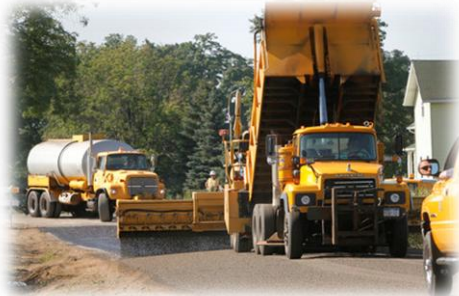
Asphalt and chips are applied to the existing pavement

The first step in the BST system is to spray a heavy coating of emulsified asphalt oil onto the street surface and then immediately cover the oil with specified rock size (3/8" or less). Rollers are then utilized to embed the rock into the oil. The second step occurs after the first seal is allowed to cure and harden for typically three to seven days. The second step consists of a fog seal, which is a light coating of slow-setting emulsified asphalt sprayed on the rock to seal the new road surface. The result is a cost-effective seal coat that will preserve the existing pavement, slow pavement deterioration, and provide a new pavement wearing surface. See the photographs below, which show the typical two-part BST/fog seal