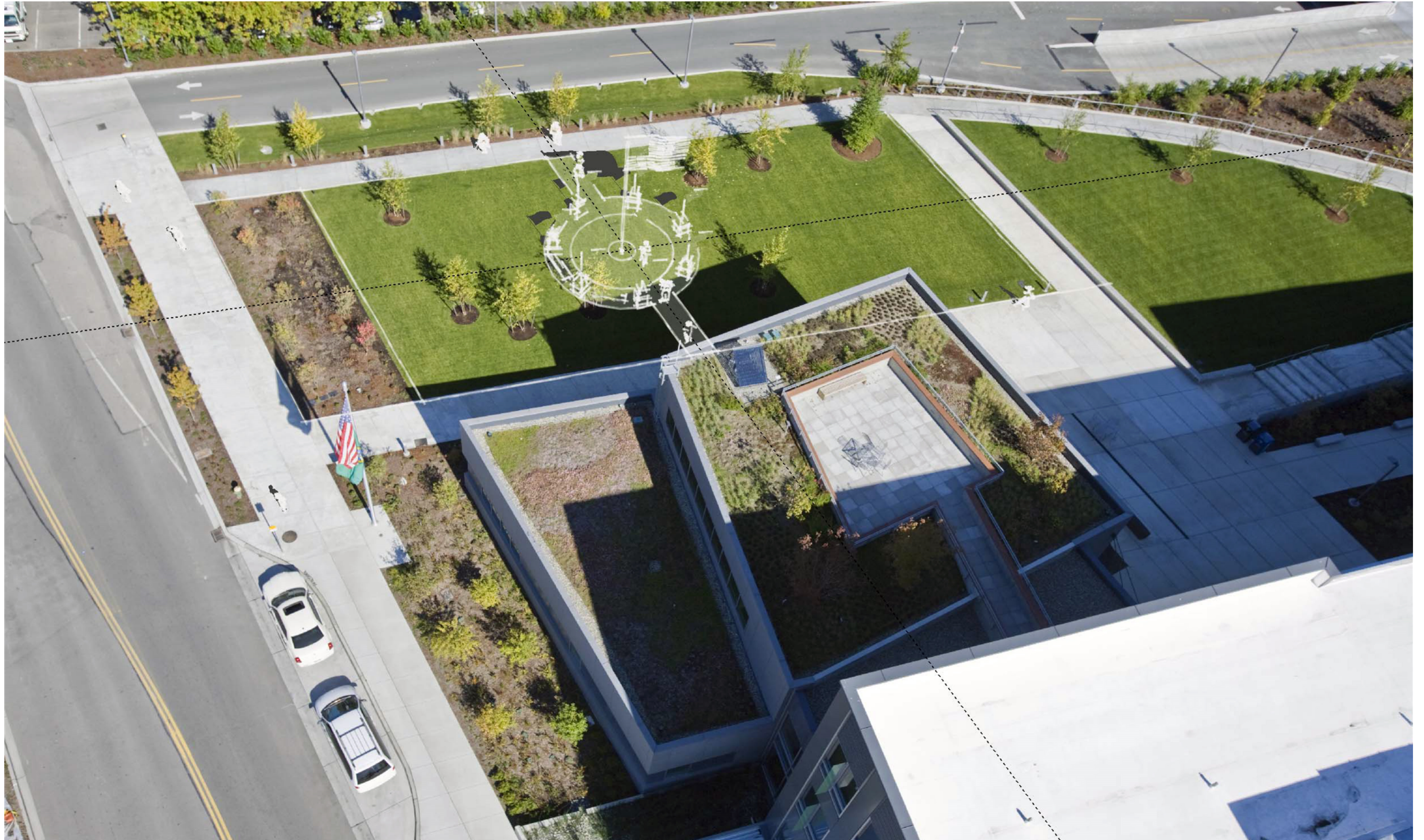
AERIAL VIEW FROM SOUTH