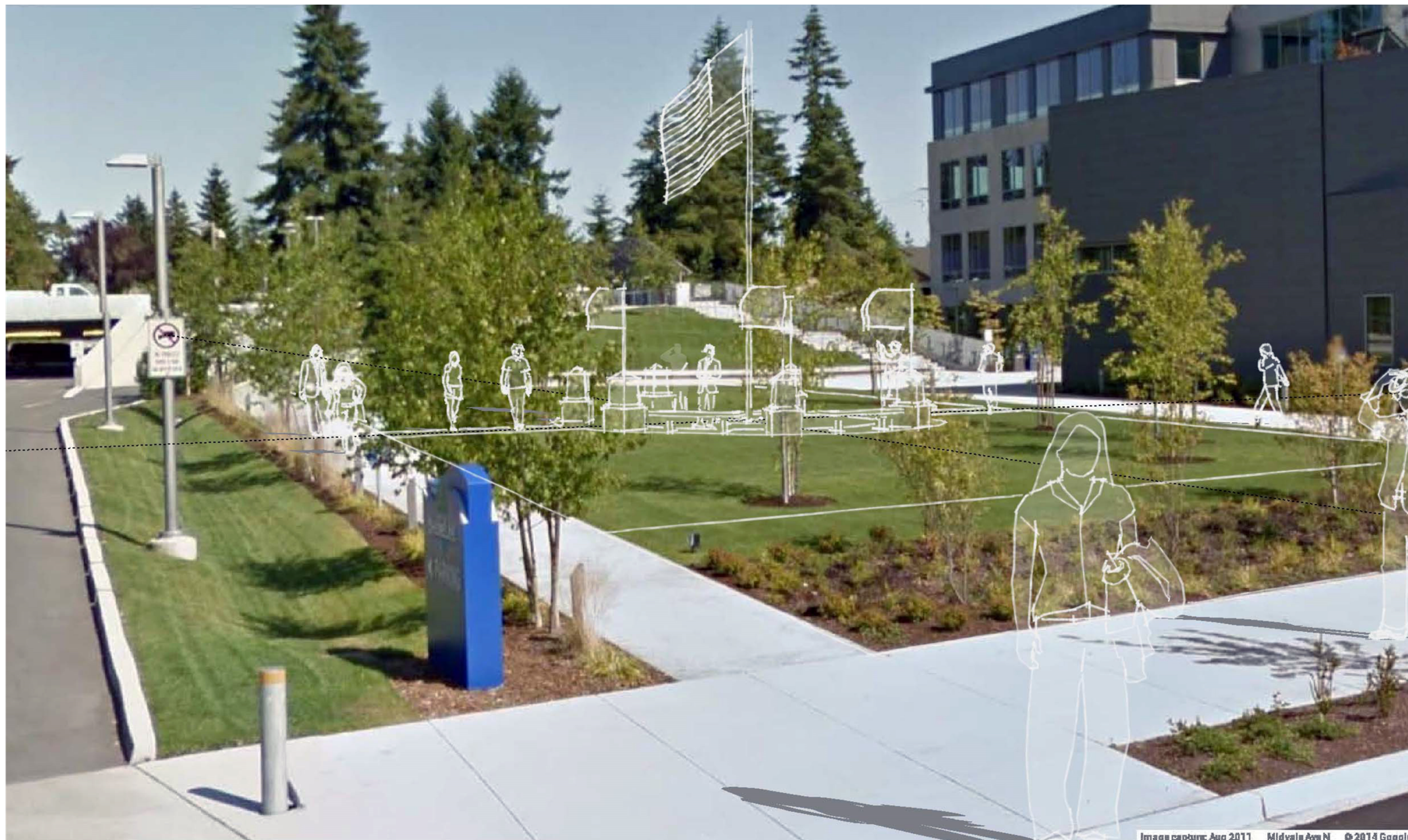
Image capture: Aug 2011 Midvale Ave N VIEW FROM MIDVALE AVE N