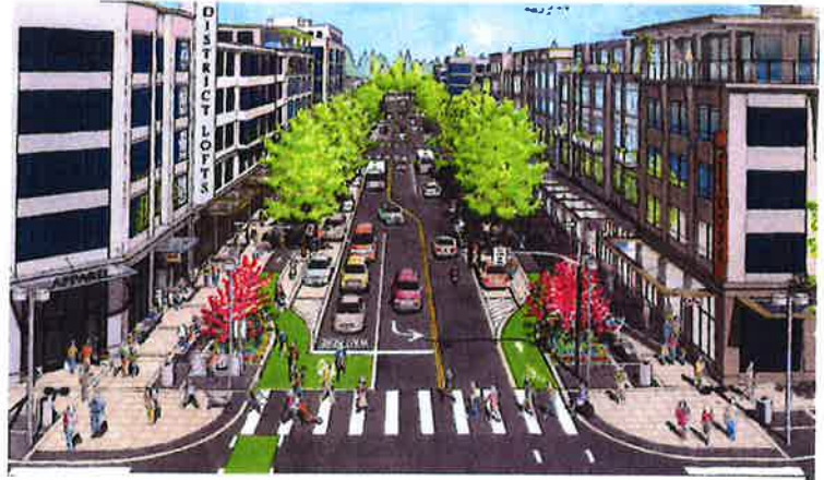
Redmond 152 Avenue NE Complete Streets Plan

TIB will limit the number of nominations based on the number of eligible cities and counties, the amount of program funding, and the size of the nominating organization. TIB plans to invite the following state agencies and statewide non-profits to become nominating organizations: