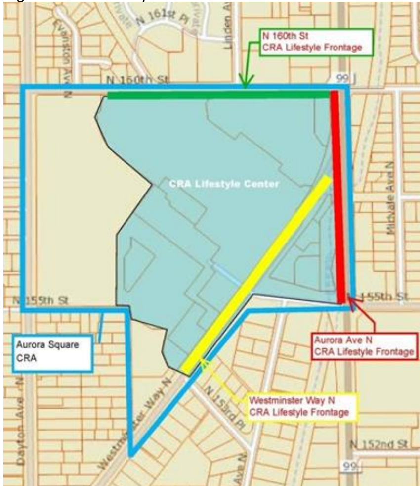
Figure 1: Aurora Square CRA with Shoreline Place in Shaded Blue Area

Note: The colored lines show the allowed locations for pylon signs that were adopted in the 2015 sign code (one per frontage).