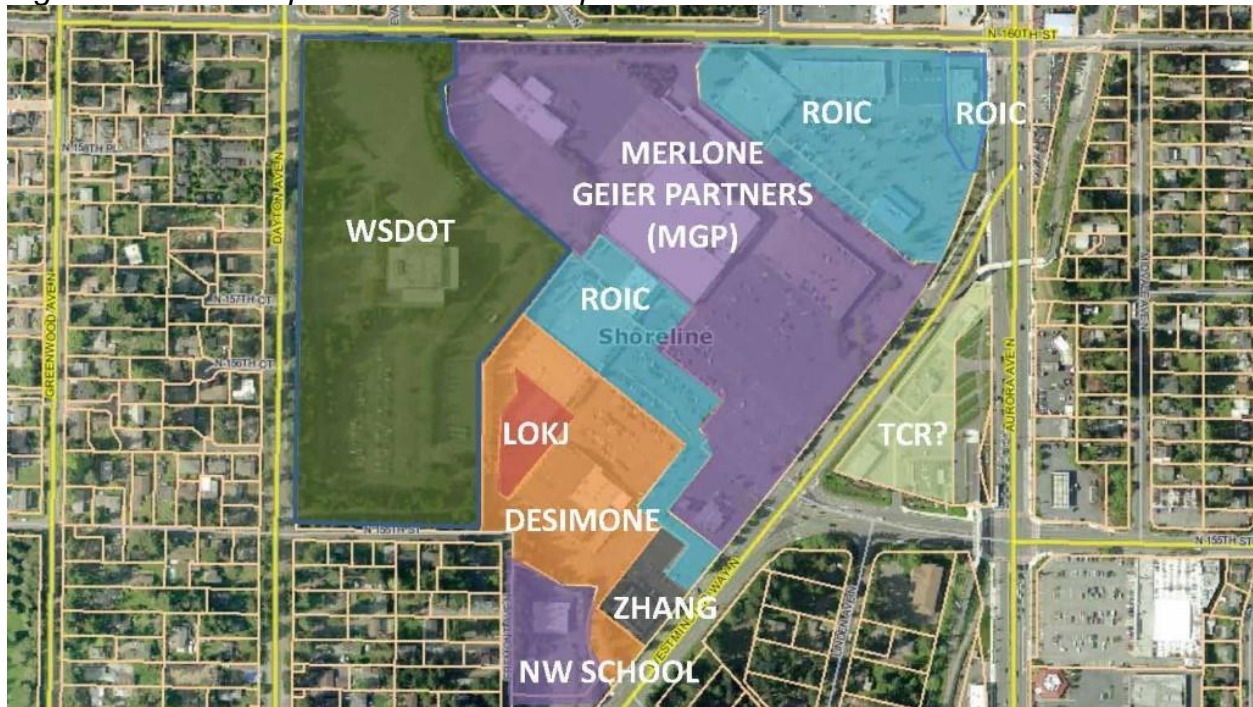
Figure 2: Aurora Square CRA Ownership