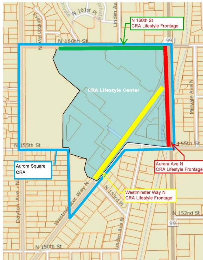
Map 20.50.620.B—Aurora Square CRA

Aurora Square Community Renewal Area, as defined by Resolution 333, the Aurora Square Community Renewal Area Plan, and Map 20.50.620.B.