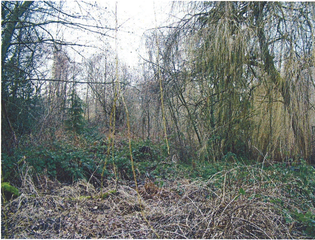
Subject, Looking Westerly from Near the East Property Line