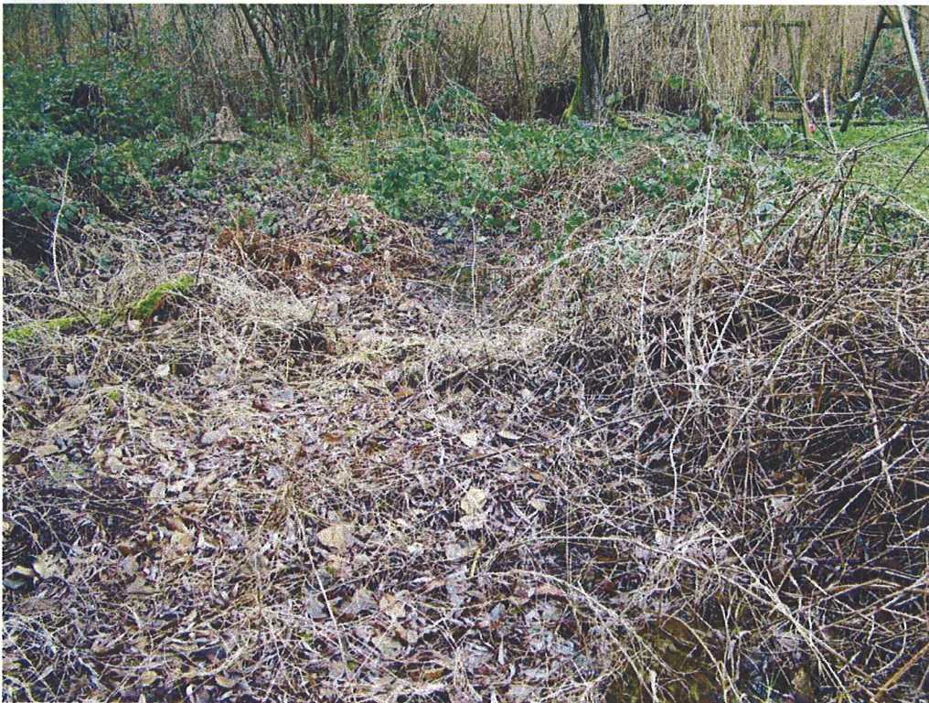
Subject, Looking Westerly from Near the East Property Line