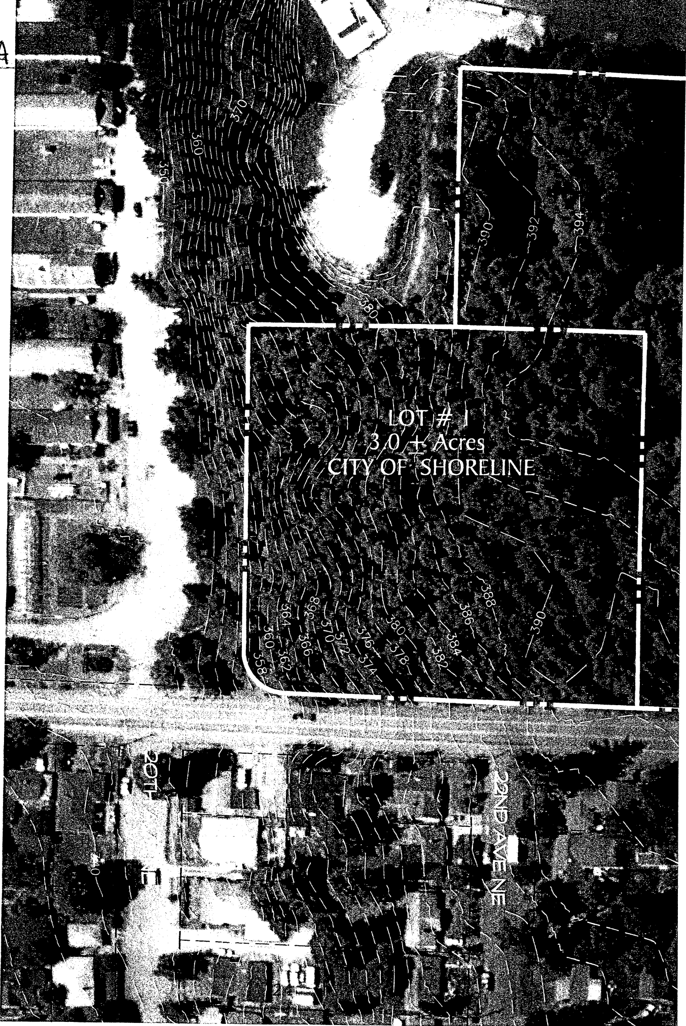
EXHIBIT A (cont.)