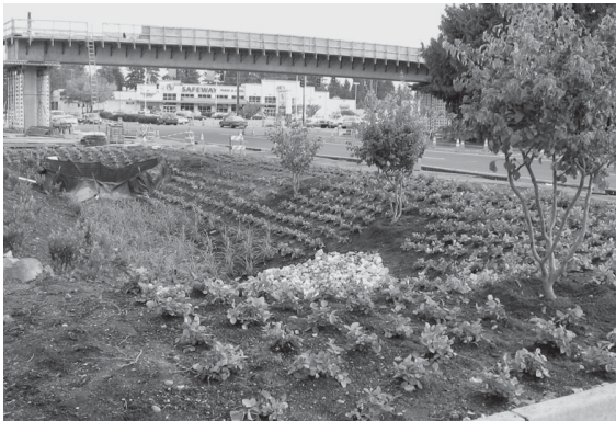
Landscaping in the storm water swale along Aurora between the Interurban Trail bridges includes sustainable, low-maintenance plantings that have year-round seasonal interest.