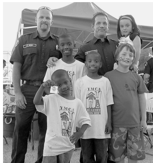
The Shoreline Fire Department fires up some barbecue at Swingin' Summer Eve - a hit with the kids!

For more information about Shoreline summer programs and events, call the City of Shoreline Parks, Recreation and Cultural Services Department at (206) 418-3383.