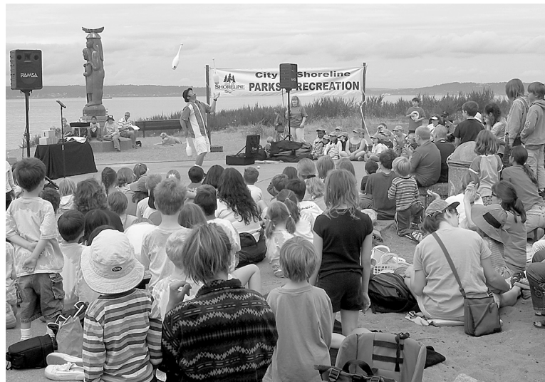
Crowds enjoy the view along with the entertainment at free concerts at Richmond Beach Saltwater Park.