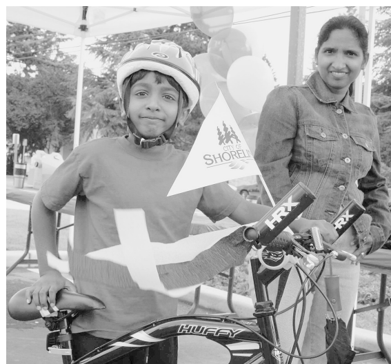
The City of Shoreline celebrated the completion of its construction on the Interurban Trail at a ribbon-cutting and dedication ceremony September 22. Kids decorated bikes for a parade down the trail after the ribbon was cut.