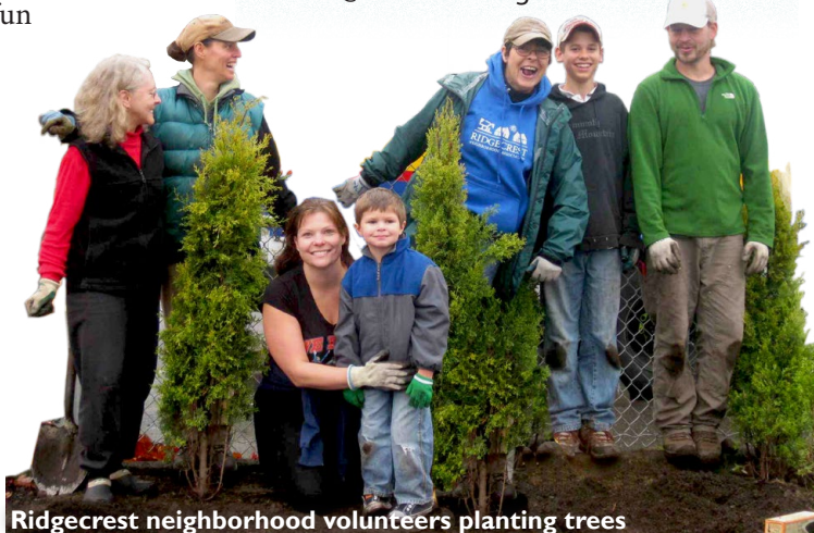
Ridgecrest neighborhood volunteers planting trees