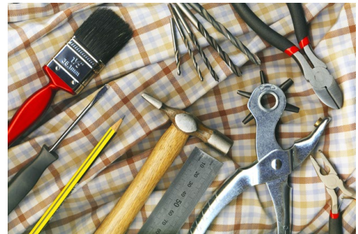
Home improvement workshops