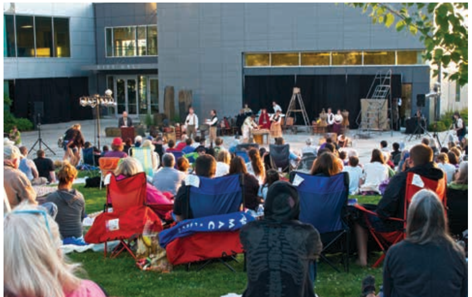
Aurora Theatre Company's 2014 performance of Into the Woods