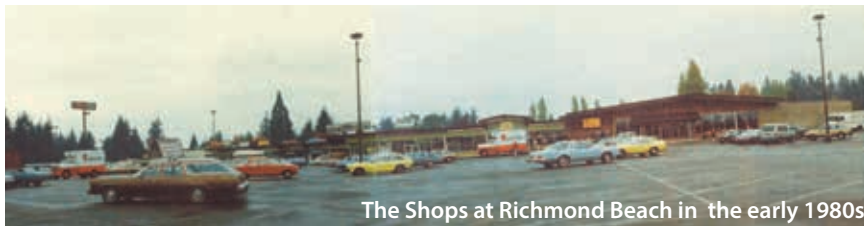
The Shops at Richmond Beach in the early 1980s

The City is scheduled to complete the study in December 2015, which means the City could resume the 145th Street Station Subarea planning in January 2016. For more information and background, including potential zoning scenarios and environmental analysis performed to date, visit shorelinewa.gov/lightrail . You can also contact Senior Planner Miranda Redinger at (206) 801-2513 or mredinger@shorelinewa.gov with questions.