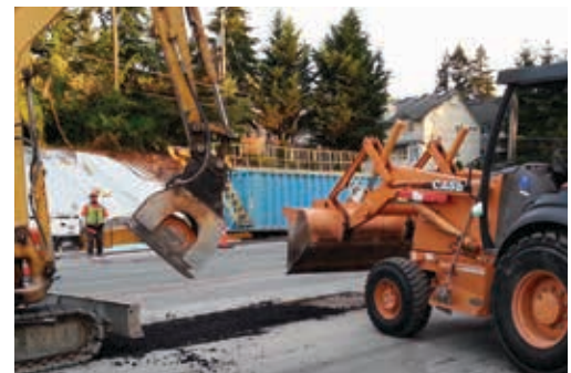
Aurora construction update