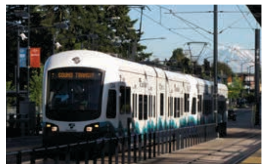
185th Street station subarea