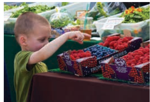
Shoreline Farmers Market