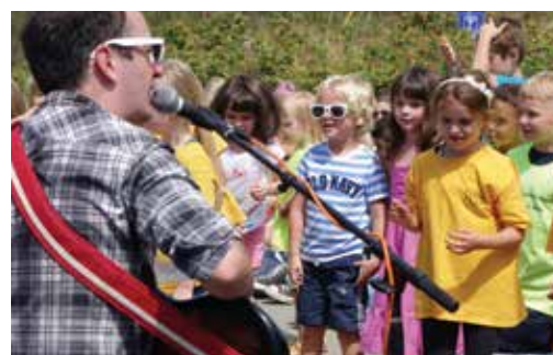
Summer events calendar