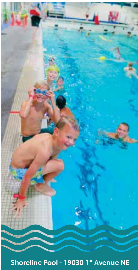
Shoreline Pool - 19030 1 st Avenue NE