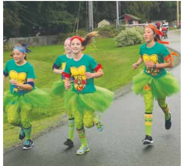
Monster Mash Dash participants finishing strong

More information: shorelinewa.gov/calendar