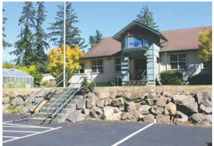
Richmond Highlands Recreation Center front hedges were removed for increased visibility. In addition to interior maintenance, the parking lot was resurfaced and restriped.

All of this maintenance work is necessary to ensure the facilities continue to meet the needs of the community for years to come.