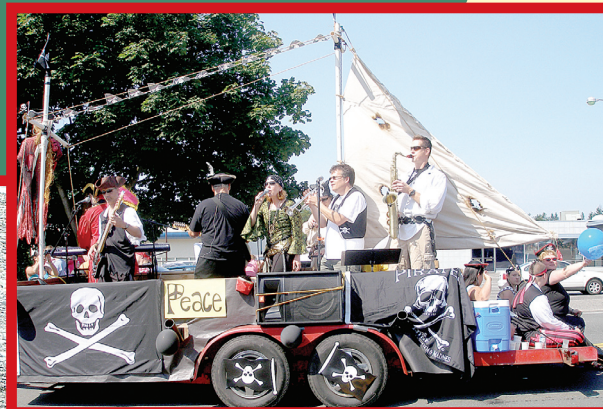
The Shoreline All Stars hit the Parade with their pirate float and band.