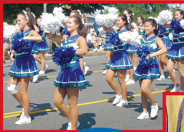
The Shorewood Drill Team was part of the Shoreline School District and Shoreline Community College joint Parade entry.