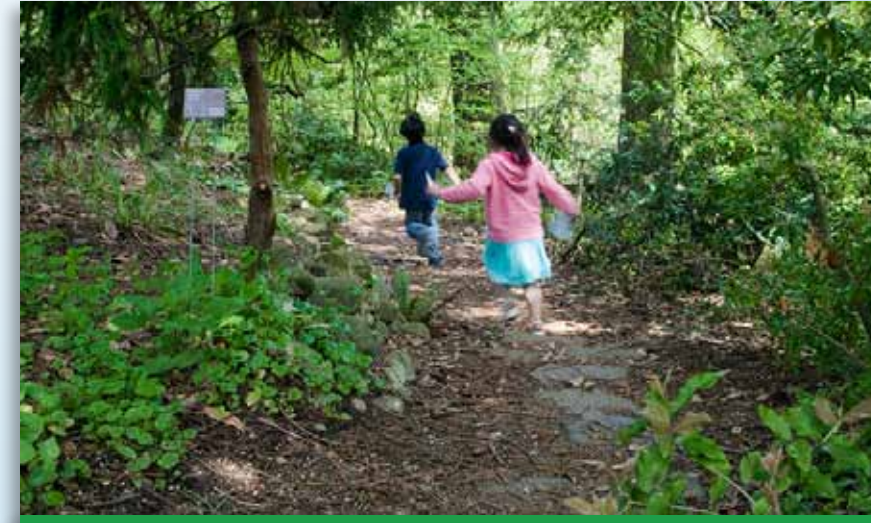
Upcoming Family Workshops:

This year, the Foundation will also add Family Workshops featuring hands-on projects that promote learning about the natural world together. Create fun, sculpted hypertufa planters, make a leaf press and field journal to take on family expeditions, and learn about ferns while you paint beautiful fern prints on t-shirts, tote bags and aprons. All family workshops take place on Sunday afternoons from 1:00 pm to 3:00 pm at the garden and are only $10/adult and $5/child ages 5 and older. For more information about the Foundation's programs, visit www.kruckeberg.org.