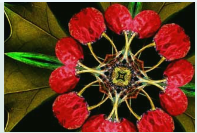
Holly by Ellen Witebsky