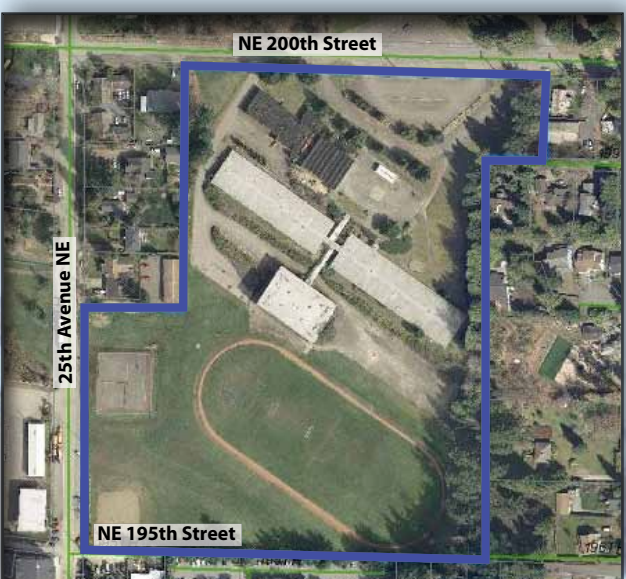
Shoreline School District's Aldercrest Annex

The 16 acre site has historically been zoned for single family (R6) and institutional use. Years ago, the School District relocated Kellogg Middle School from the prop-