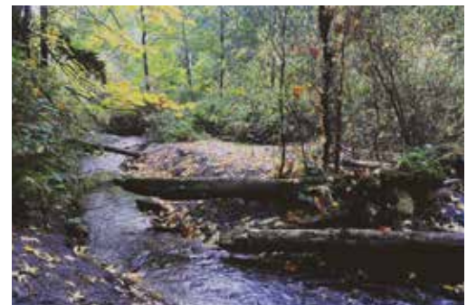
Critical Areas Regulations