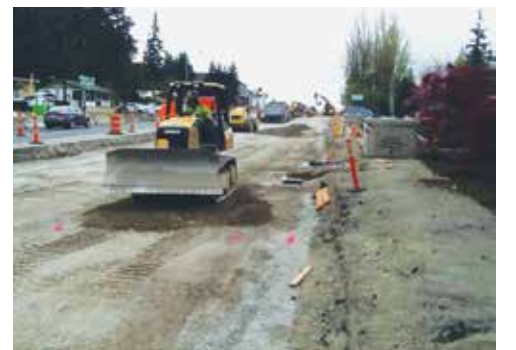
Aurora construction update