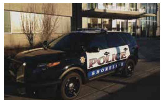
Police Annual Service Report