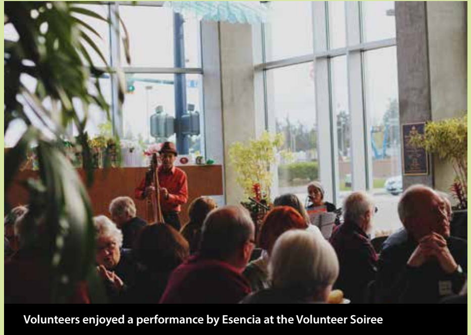
Volunteers enjoyed a performance by Esencia at the Volunteer Soiree

Individual volunteers assist instructors at Spartan recreational center in classes so teachers can provide more one on one attention to students.