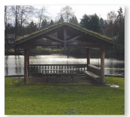
Ronald Bog Park

Fall is here and trees will soon lose their leaves. Leaves that fall into the street can cover storm drains and impede the proper flow of stormwater runoff into the catch basins. By keeping an eye on the catch basin in front of your home and clearing the leaves away from the grate, you can help prevent flooding.