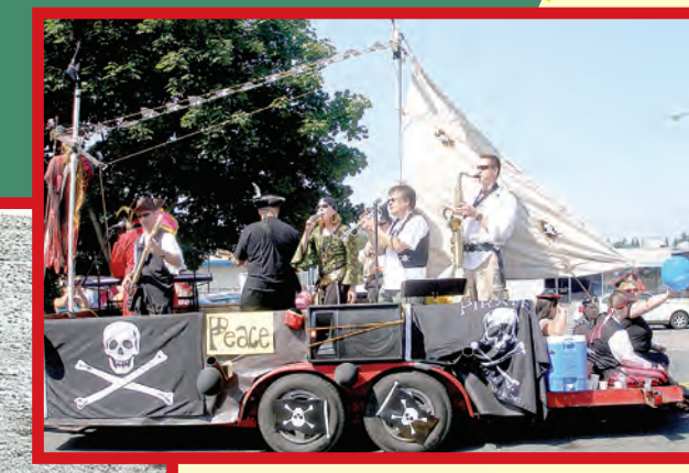
The Shoreline All Stars hit the Parade with their pirate float and band.