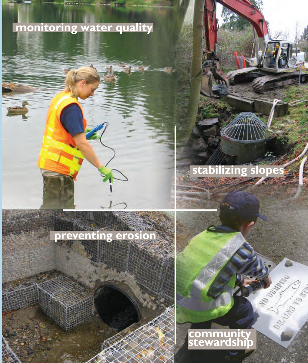
monitoring water quality