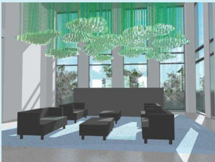
Leo Berk's conceptual design for a suspended sculpture in the main lobby of City Hall was inspired by Shoreline's 14 neighborhoods.

The plastic sheet material the artist has chosen for the sculpture shows a pale tint on its face but focuses brilliant color through cut edges. The suspension cables are also a striking part of the artwork, acting as "reverse rain" with over 500 vinyl-coated cables extending from the tops of the sculptural forms to the ceiling. The sculpture will be visible at night through the building's glass wall that faces the intersection of Midvale Avenue N and N 175 th Street. The Shoreline City Hall is planned to be open by fall 2009.