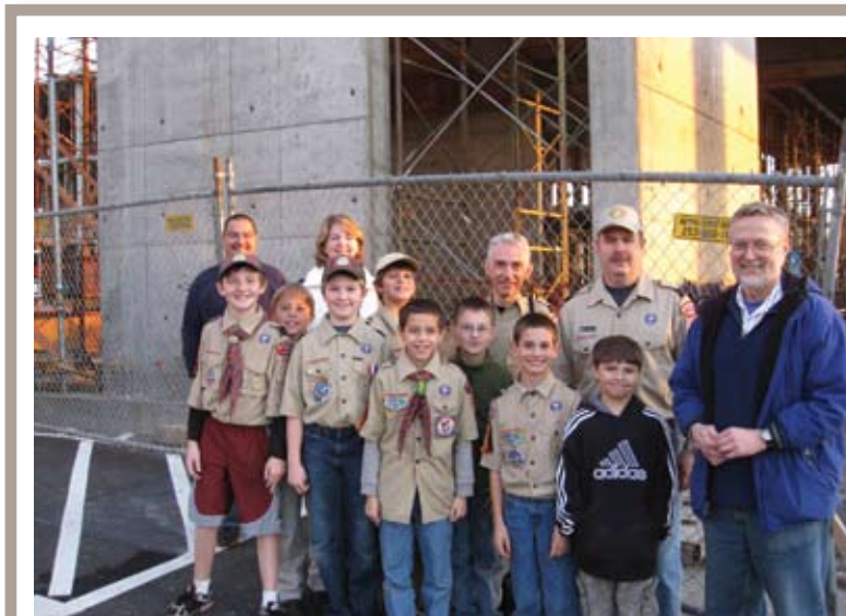
Cub Scouts Pack 105 are earning their engineering activity badge by learning how the new City Hall is being built.