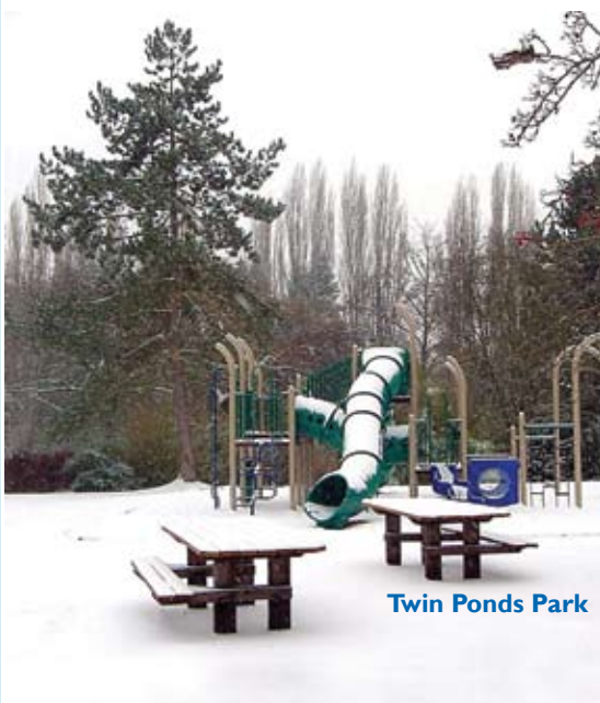
Twin Ponds Park