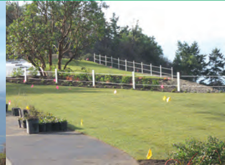
Saltwater Park improvements include the new picnic area and gathering space overlooking Puget Sound, pedestrian sidewalks, stairs, trails and slope plantings for stability.