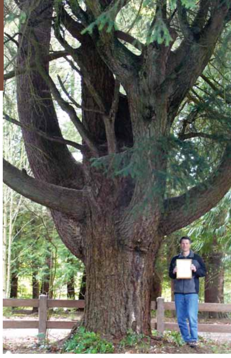
Greg Kulseth with a Champion Wolf Tree at Boeing Creek Park, one of two included in the "unique" category in the 2008 Champion Tree Contest.

Each champion tree will have a sign next to it with information about the tree and its value to our urban forests. Later this year, a brochure will be developed listing all the trees and locations so that park visitors can locate and learn more about them. The contest was funded by grants from the City of Shoreline and National Wildlife Federation. The 2009 champion tree contest will be expanded to include native trees found on private as well as public property. To learn more, contact Barbara Guthrie at (206) 542-3242, guthdall@msn.com.