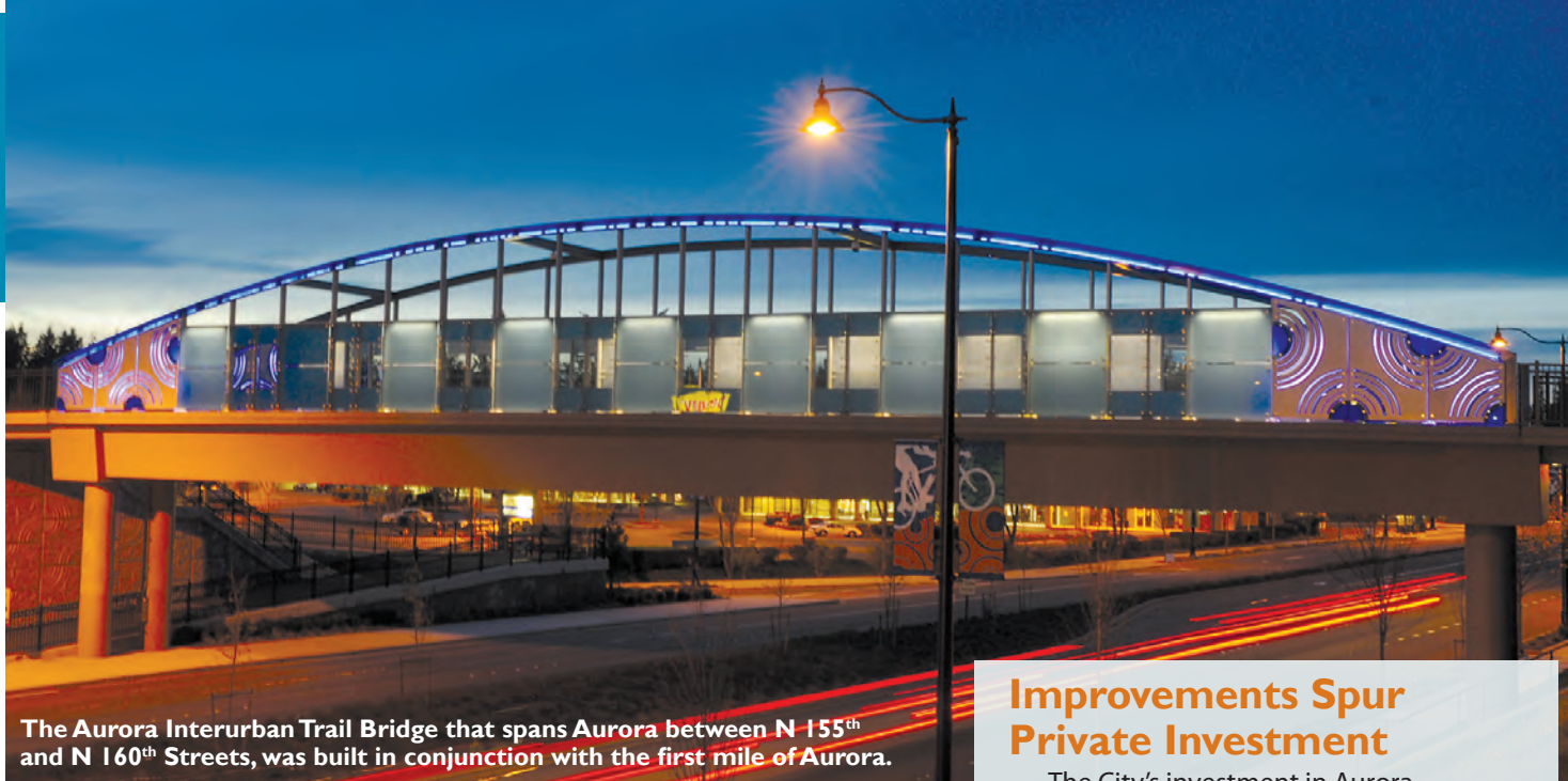
The Aurora Interurban Trail Bridge that spans Aurora between N 155 th and N 160 th Streets, was built in conjunction with the first mile of Aurora.