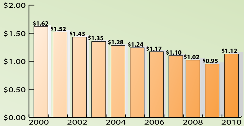
City of Shoreline Property Tax Rate Per $1,000 Valuation 2000-2010

limit the annual increase for property tax levies in 2012 through 2016 to an amount not to exceed the Seattle Consumer Price Index measure of inflation and will use the 2016 levy as the base for future levies.