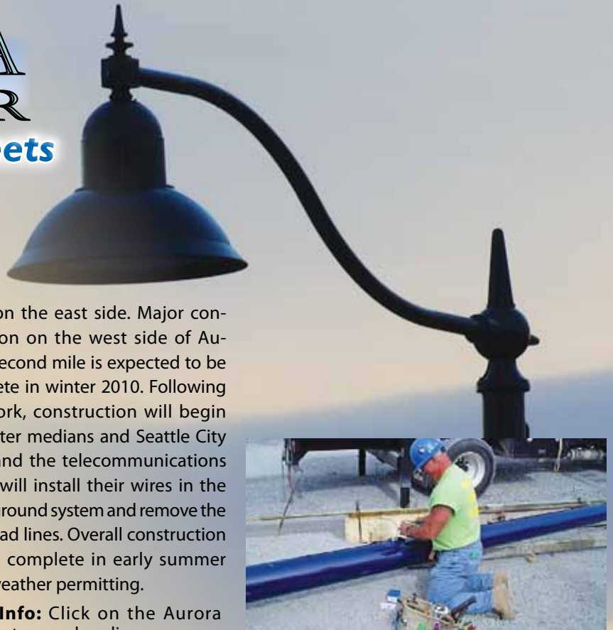
The new light poles are now installed along the east side of Aurora between N 165 th and N 185 th Streets.

Contact Us: 24-hour project hotline (206) 801-2485, aurora@shorelinewa.gov