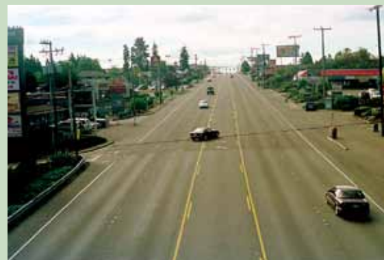
Aurora Avenue N at N 152 nd Street before (above) and after the first mile of the project was completed.