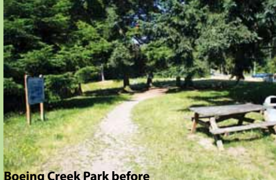
Boeing Creek Park before