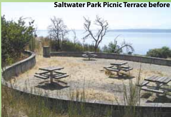
Saltwater Park Picnic Terrace before