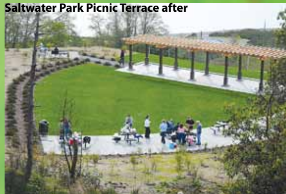
Saltwater Park Picnic Terrace after

Background photo taken at Kruckeberg Botanic Garden.