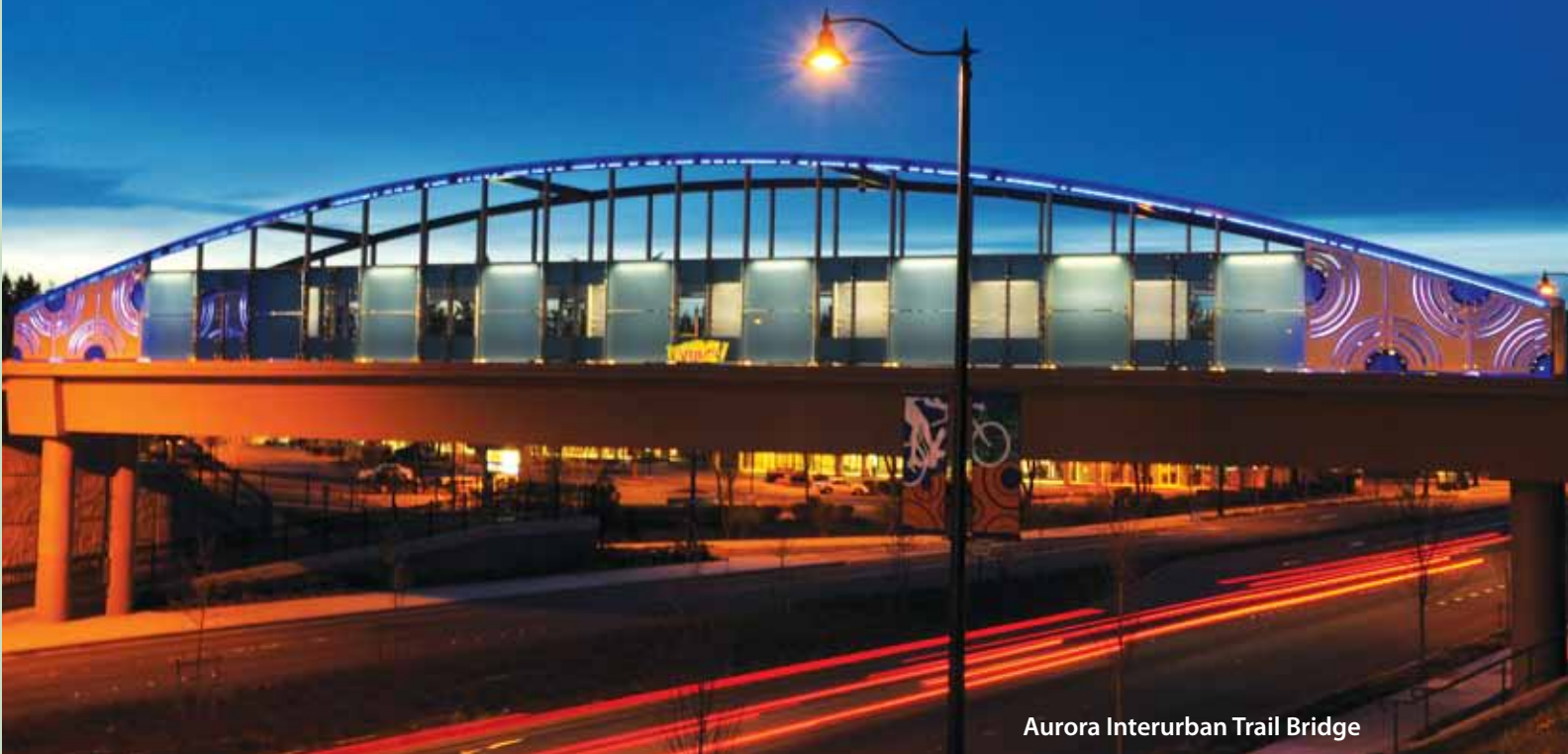
Aurora Interurban Trail Bridge