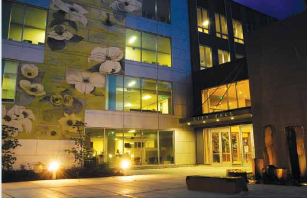
Shoreline City Hall courtyard

This is a combination of two existing projects: the Midvale Avenue N Drainage Project and Darnell Park Neighborhood Drainage Project. The undersize pipe and lack of detention contributed to local flooding near Midvale Avenue N and Darnell Park, and erosive flows in Shoreview Park. The project helped to reduce flooding, provide additional detention and enhance water quality.