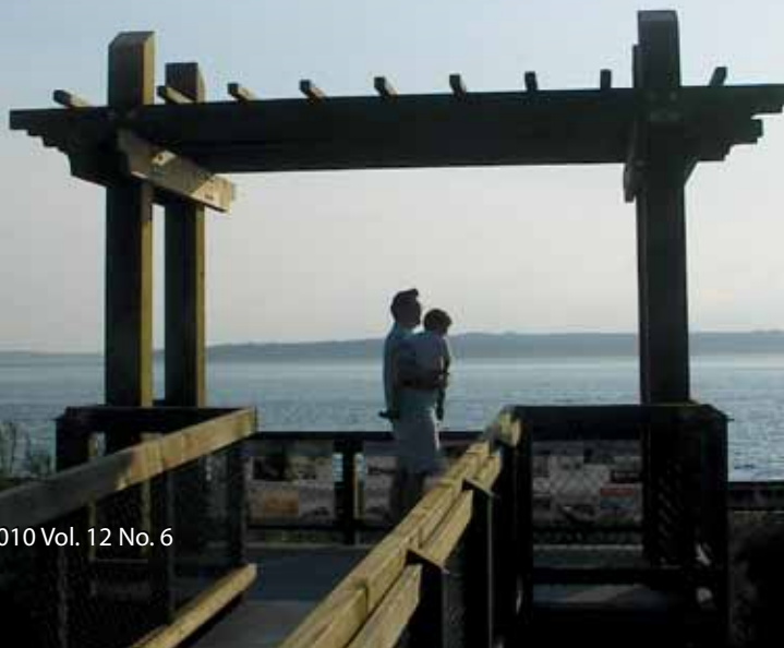
Viewing platform at Kayu Kayu Ac Park