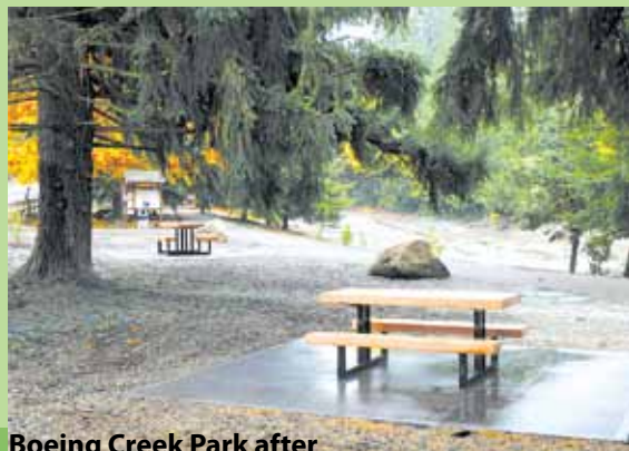
Boeing Creek Park after