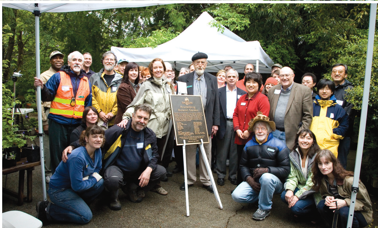
Elected officials, Foundation and PRCS Board members, volunteers, City staff and Garden supporters celebrated the Garden's dedication in June.