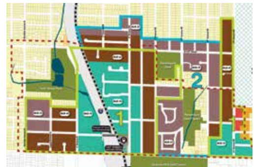
145 th Subarea Zoning

Look for more information in your mail, on the City's website, and at City events as we get closer to March 1, 2017. For questions, contact trashtalk@shorelinewa.gov or (206) 801-2350.