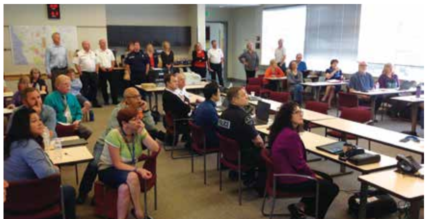
Receiving a status briefing at the Emergency Operations Center during the Cascadia Rising exercise