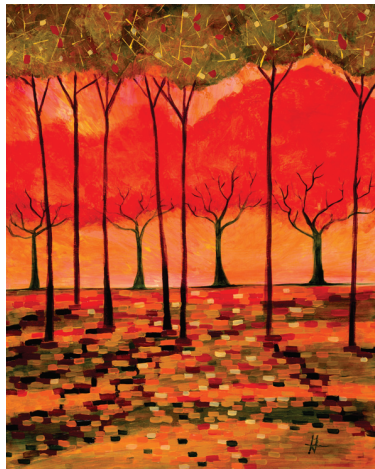
Warm Afternoon by Cheryl Waale

Don't miss the permanent artwork in the courtyard and lobby. Linda Beaumont's Limelight graces four stories of the north façade facing the courtyard and Leo Saul Berk's Cloud Bank shimmers over the lobby living room area. There is also a bur-