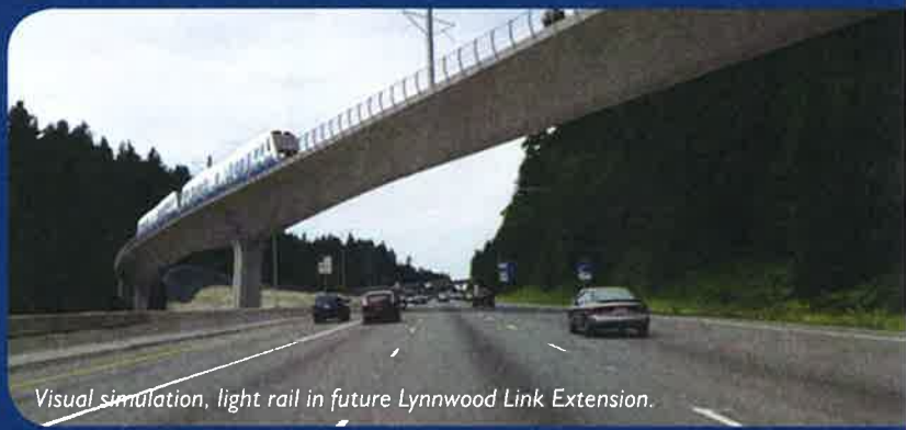
Visual simulation, light rail in future Lynnwood Link Extension.

Learn more about this light rail project: soundtransit.org/LE