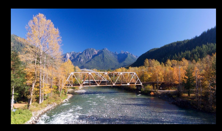
ShoreView Park, Seattle Wa.