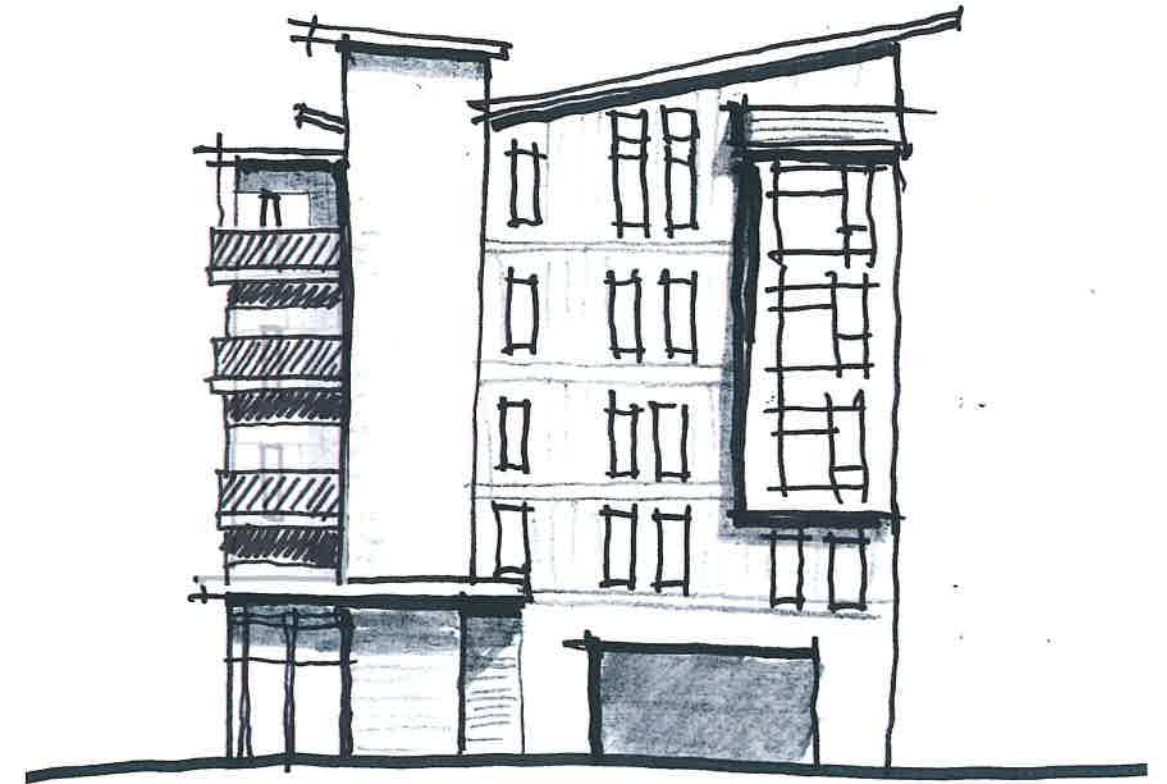
① SOUTH ELEVATION 1/16"=1'-0"