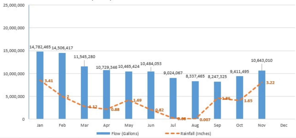
2020 Monthly Pump Station Flow and Rainfall Data