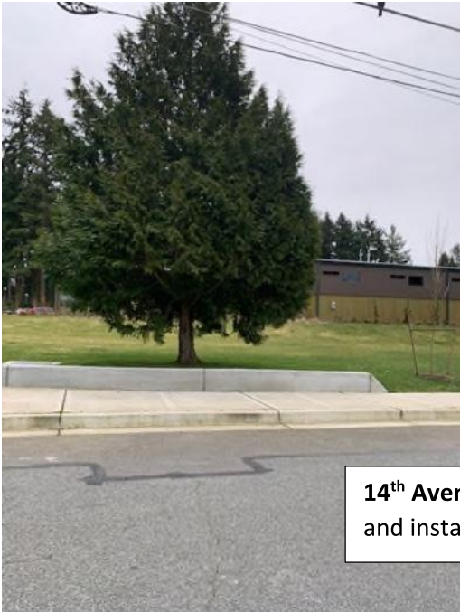
14 th Avenue NE – Eliminate amenity zone and install small wall