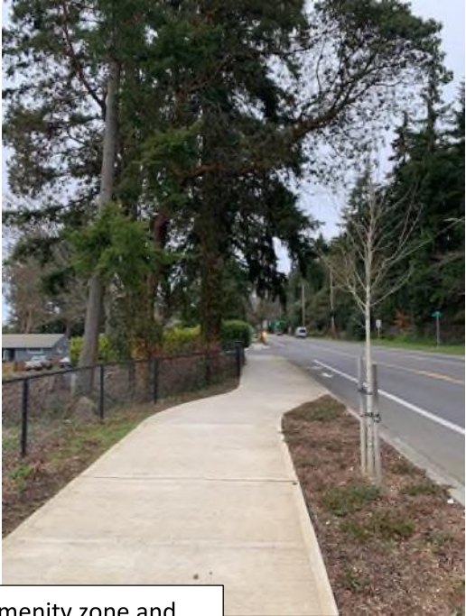
15 th Avenue NE at NE 58 th Street – modified amenity zone and moved sidewalk to behind curb