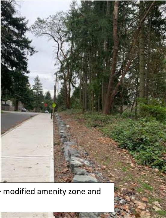
NE 165 th Street at 25 th Avenue NE– modified amenity zone and moved sidewalk to behind curb