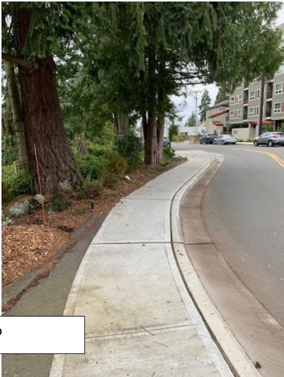
Sidewalk moved to behind curb