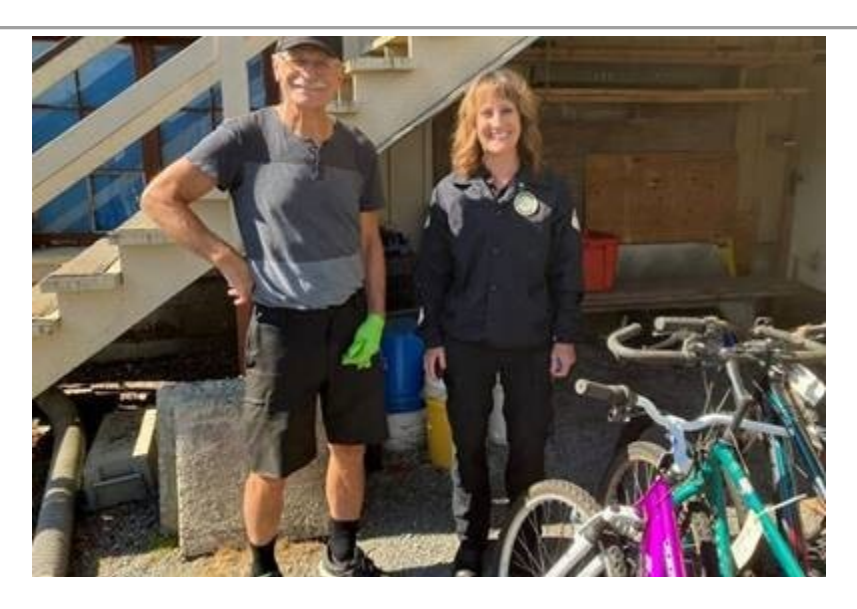
Volunteering with Bikes for Kids (above) - Vacationing in Curacao (below)