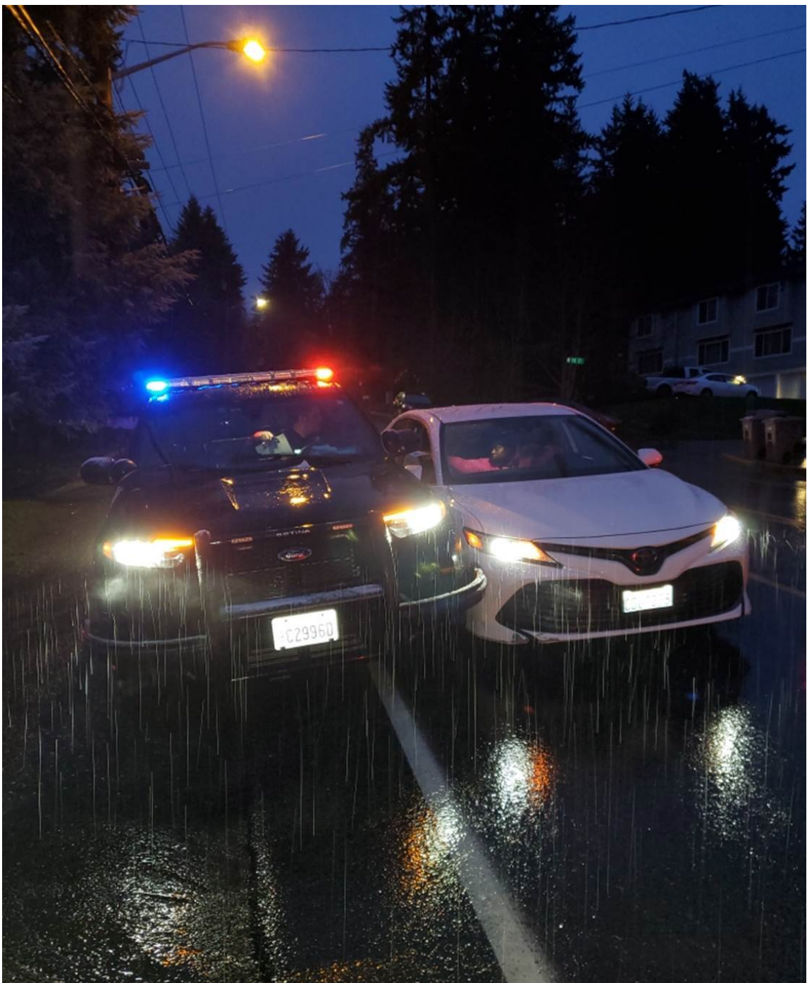
During the treacherous icy Thursday morning, officers responded to around 15 collisions in various parts of Kenmore. When investigating one such collision on 83rd PI NE, Chief Moen was blocking a part of the road due to vehicles being stuck up ahead. A driver slid sideways on the ice and struck the side of Chief Moen's car. There were no injuries and minimal damage. Now pinned in his car by the sedan, information was exchanged through the windows of the respective vehicles...a likely Kenmore PD and KCSO first.