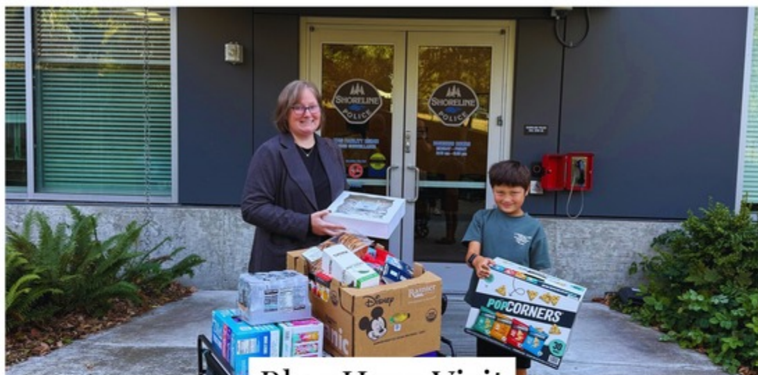
Blue Hero Visit