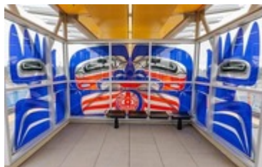
Photo: "Generational Confluence" by Preston Singletary, Sound Transit Lynnwood Station. Courtesy of Sound Transit.

We appreciate and thank those who will be working during the holiday.