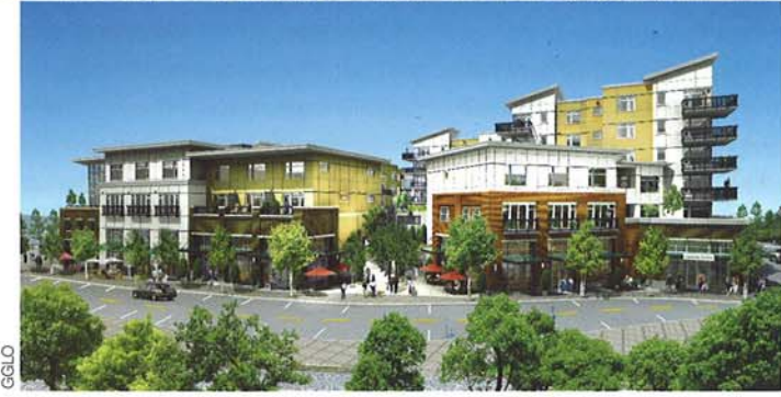
ABOVE: Burien Town Center Building Design by GGLO TOP: Burien Town Center Master Plan

Long established cities like Seattle, Everett, and Tacoma have very distinct downtowns, but the region's thirteen cities incorporated since 1990 have largely had to create their "town centers." Some, such as Burien, had the street grid of a nascent business district in place for many years, but lacked strong residential or civic components. Others, such as Shoreline, had no well-developed downtown grid, growing instead around commercial corri-