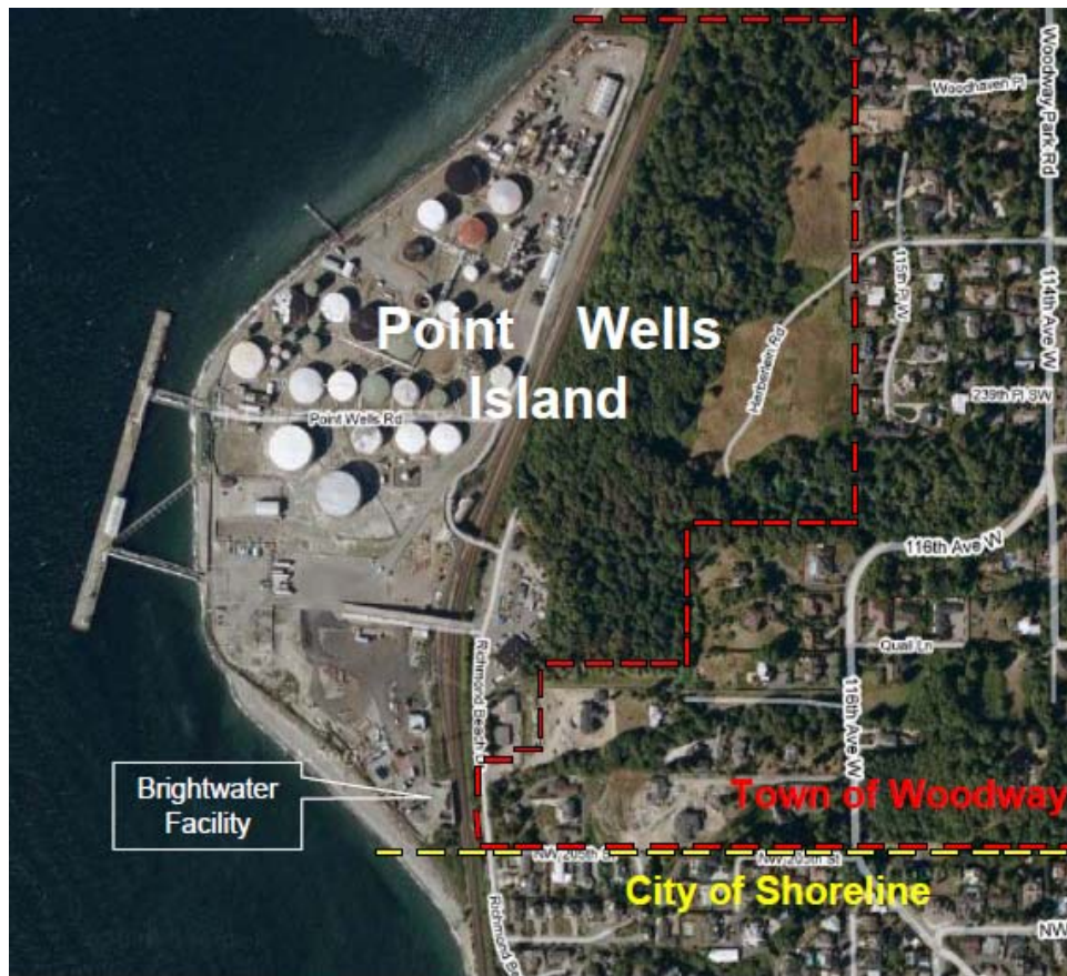
Figure 1 – Point Wells unincorporated island

Point Wells is an unincorporated island of approximately 100 acres in the southwesternmost corner of Snohomish County. It is bordered on the west by Puget Sound, on the east by the Town of Woodway, and on the south by the town of Woodway and the City of Shoreline (see Fig. 1). It is an “island” of unincorporated Snohomish County because this land is not contiguous with any other portion of unincorporated Snohomish County. The island is bisected roughly north-south by the Burlington Northern Railroad (B.N.R.R.) right-of-way.