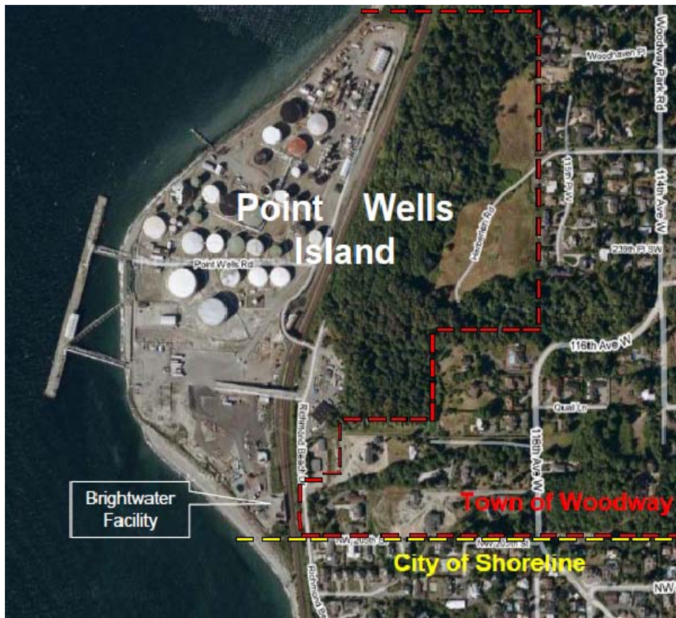
Figure 1 – Point Wells unincorporated island

Point Wells is an unincorporated island of approximately 100 acres in the southwesternmost corner of Snohomish County. It is bordered on the west by Puget Sound, on the east by the Town of Woodway, and on the south by the town of Woodway and the City of Shoreline (see Fig. 1). It is an “island” of unincorporated Snohomish County because this land is not contiguous with any other portion of unincorporated Snohomish County. The island is bisected roughly north-south by the Burlington Northern Railroad (B.N.R.R.) right-of-way.