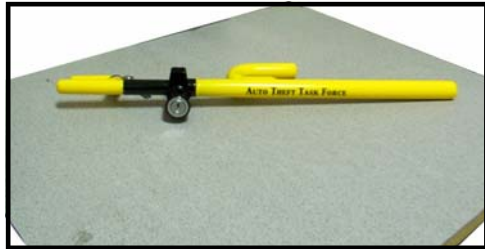
AUTO THEFT "TASK FORCE" DEVICE

Task Force devices are available at our main precinct and both storefront